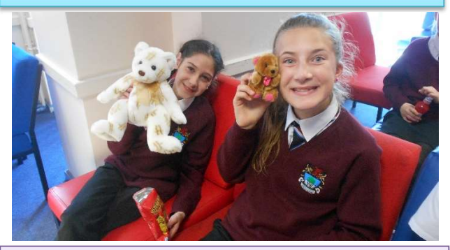
The Sixth Form held a Teddy's Bear Picnic for the Year 7's a couple of weeks ago. Pom-Bear crisps and a quiz was enjoyed by many!