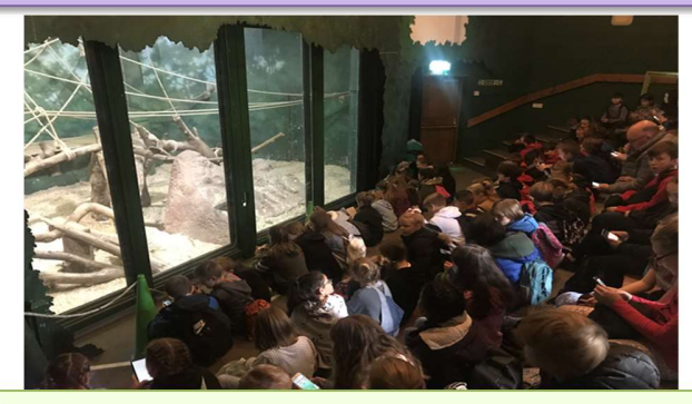
Over 80 Year 7 pupils visited the Welsh Mountain Zoo on Saturday 5<sup>th</sup> October. The Chimp encounter was a highlight!