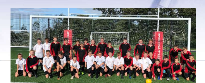
A great performance from the Year 7 football team on September 23rd in the Welsh Cup. Lots of resilience to come back from a goal down to draw 2-2 and then win on penalties against Ysgol Creuddyn!