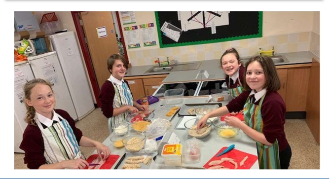
The Year 7's appear to be enjoying the new and exciting project curriculum!