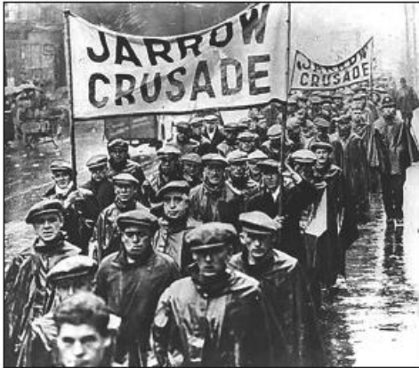
[Unemployed workers on their march from Jarrow to London in 1936]

What can be learnt from Sources A and B about the Jarrow Crusade?