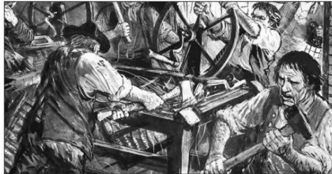
[Luddite rioters in the early 19 th century]