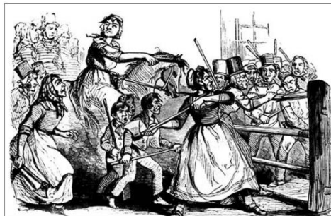
[Rebecca rioters in the 1840s]