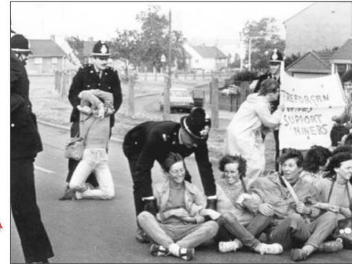
[Miners' wives being arrested during the miners' strike in 1984]

Look carefully at all three sources and the information beneath them