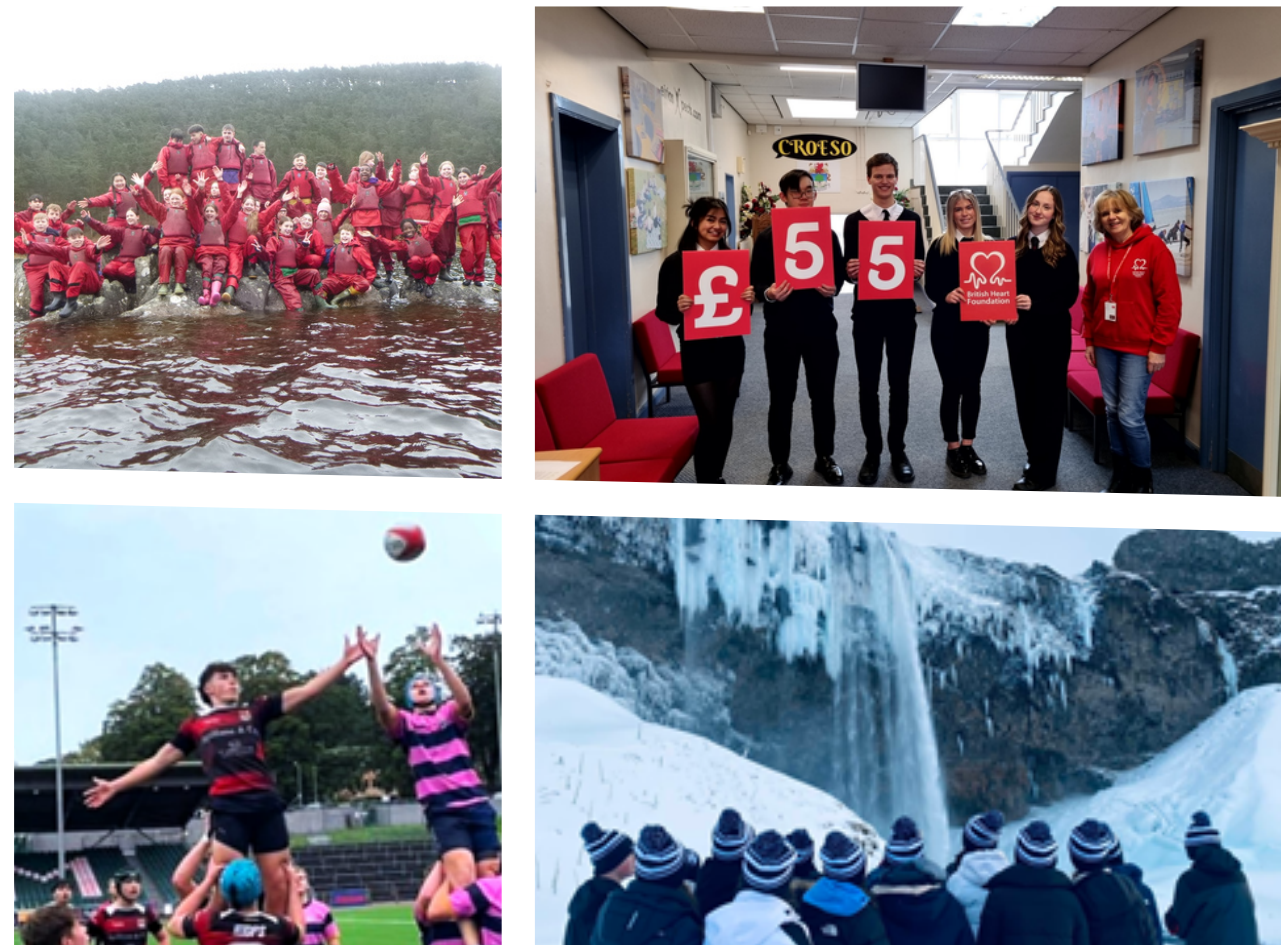
To read more about our young people's achievements, please visit News / Ysgol Eirias and follow us on social media.