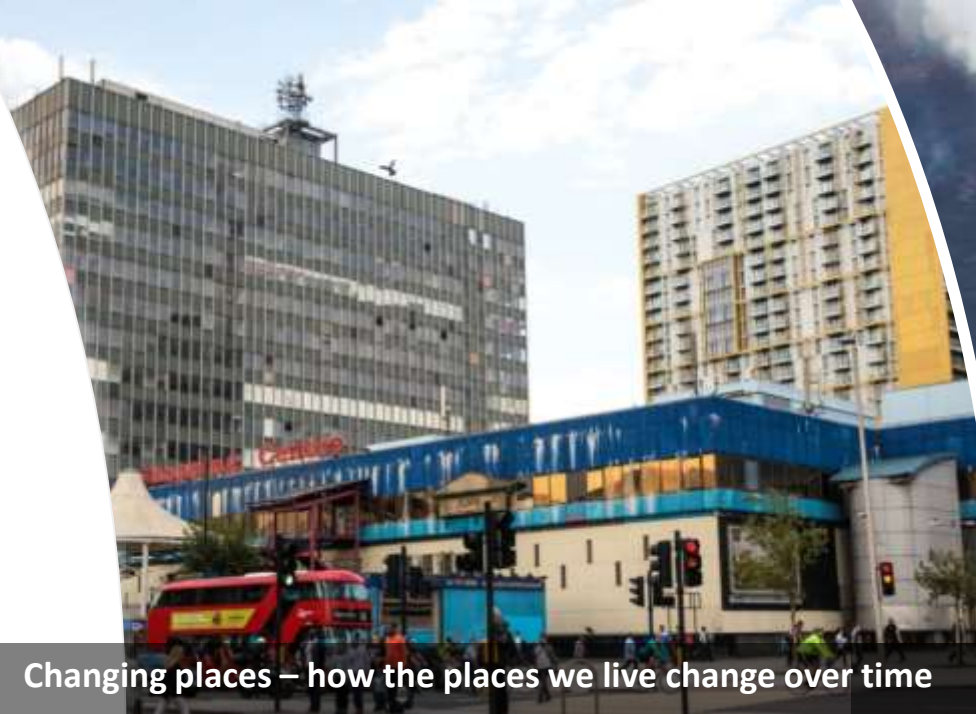
Changing places – how the places we live change over time