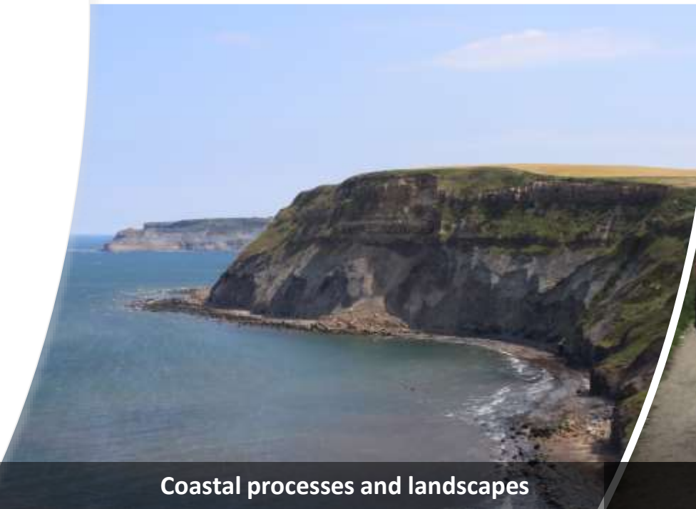
Coastal processes and landscapes