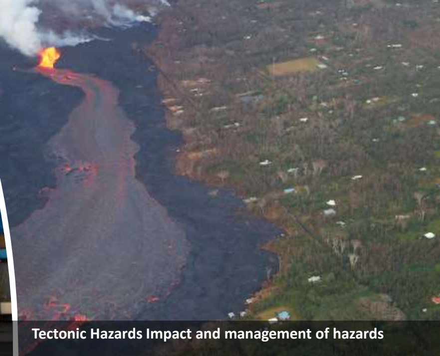
Tectonic Hazards Impact and management of hazards