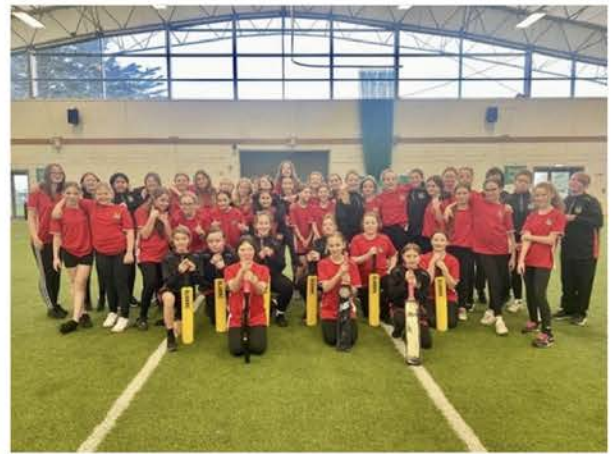
An introductory cricket session for our Year 7 learners delivered by Cricket Wales in the indoor Barn facility.

Here at Ysgol Eirias we believe that learning is derived from experiences both in and outside of the classroom. We work closely with Careers Wales to provide opportunities for our learners to engage with local and national employers. Local, national and international trips take place every year to enhance learning experiences for our pupils. We are proud of our Duke of Edinburgh provision which offers pupils the chance to gain skills and qualifications in the Bronze, Silver and Gold awards.