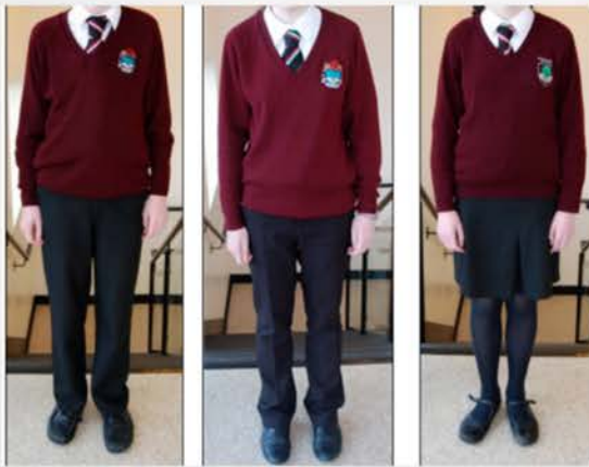
Pupils in Years 7-11 (All items must be labelled/named)

Items of uniform are available from many high street stores. The tie and jumper are available from Boppers Boutique, Woodlands Road West, Colwyn Bay and School Talk, Mostyn Street, Llandudno. Please contact the school if you have any questions regarding uniform. Any items purchased which do not meet the criteria set out below will need to be changed.