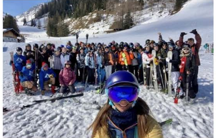
Our annual Ski Trip which provides our pupils with a fantastic opportunity from beginners GB standard learners.