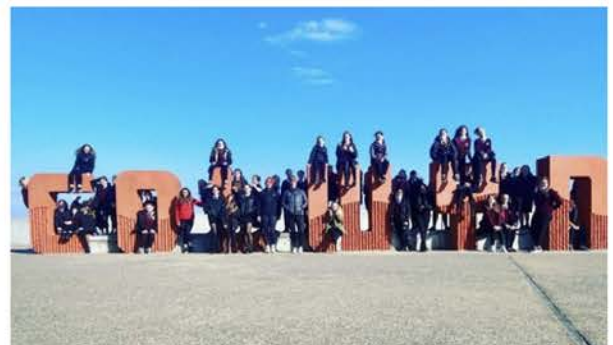
A beach clean up pupils took part in at Colwyn Bay beach. Ysgol Eirias recently adopted a stretch of the beach to help maintain part of our local community.