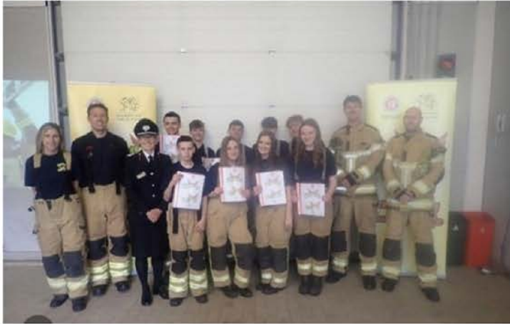
Our Year 9 pupils were lucky enough to experience a full week working with and learning the skills necessary to become firefighters