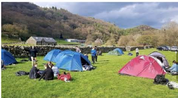
We are proud of the continuing growth and pupil involvement in our Duke of Edinburgh award programme.

Here at Ysgol Eirias we believe that learning is derived from experiences both in and outside of the classroom. We work closely with Careers Wales to provide opportunities for our learners to engage with local and national employers. Local, national and international trips take place every year to enhance learning experiences for our pupils. We are proud of our Duke of Edinburgh provision which offers pupils the chance to gain skills and qualifications in the Bronze, Silver and Gold awards.