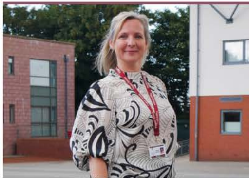
Welcome to our Prospectus