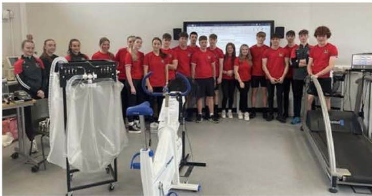
Learners experiencing the Sports Science facilities at Bangor University prior to making their University applications.