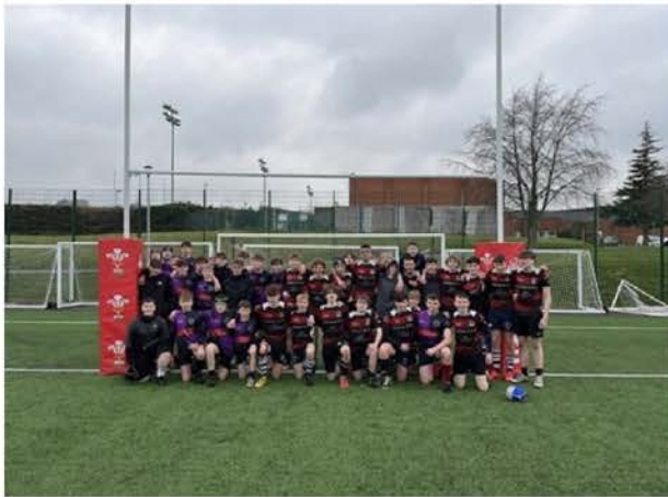
One of many competitive sporting fixtures played on our full size 4G pitch.

In addition, we offer a range of alternative activities after school including Cooking Club, Tech Club, Photography Club, Orchestra, Choir, Drama Club, Homework Club and more. Pupils are encouraged to attend as many extracurricular activities as possible to enhance their physical, social and mental wellbeing. All extracurricular provisions are free of charge.