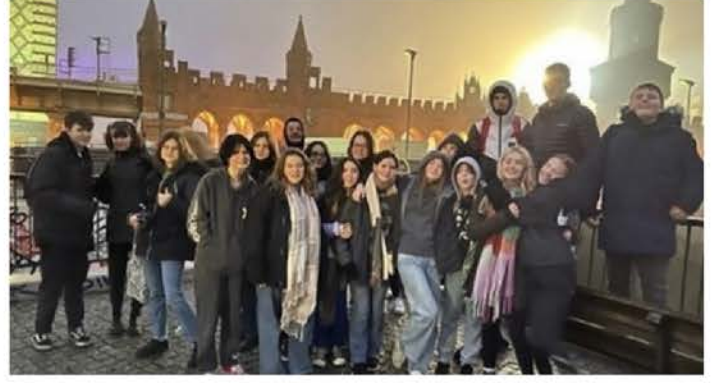
Our annual languages trip to Berlin – Allowing learners to experience a taste of the German culture whilst using their language skills learnt in lessons.